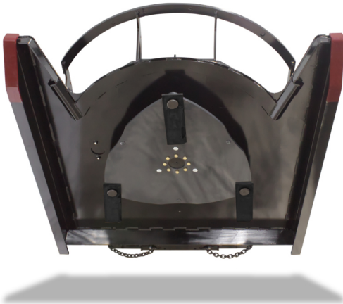
DETAIL UNDER DECK (72" MODEL)