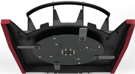
DETAIL UNDER DECK (Shown with Optional Teeth)